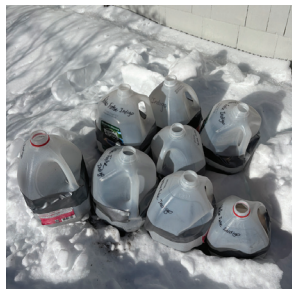
Jugs exposed to freezing temperatures in order to germinate.

Studies have shown immediate relief is found in the following: