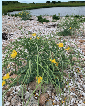
Hardy wildflowers cling to the rocky sand of Strawberry Point.

Do you have a favorite MLT preserve or park that you visit often? If so, we would love to know what you observe there! Please send us an email if you have seen something you found interesting or noteworthy - we want to know! We also may post it on social media or feature it in one of our newsletters.