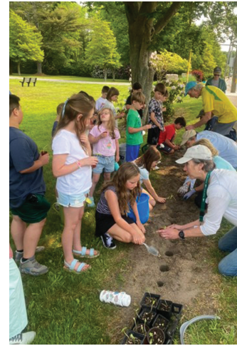
3rd graders plant their sunflowers in 2025

The students in the Southeastern Massachusetts Educational Collaborative program will experience Music in the Park. The MLT Education Committee hosts the private outdoor concert in Munro Park along Mattapoisett Harbor which provides a scenic backdrop to a magical morning of live music. Funding for these projects is through the Shoolman bequest, the Mattapoisett Cultural Council, the Marion Cultural Council, the Rochester Cultural Council, and the Massachusetts Cultural Council.