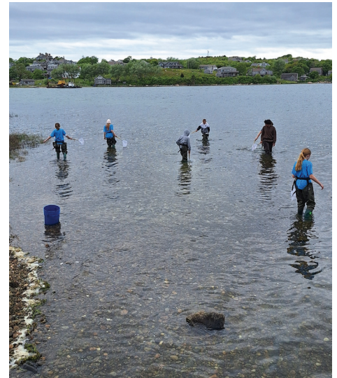
6th graders exploring the local waters of Cuttyhunk in 2025

In support of these programs, the MLT Education Committee was generously awarded $2500 by the Mattapoisett Cultural Council, $750 by the Marion Cultural Council, and $500 by the Rochester Cultural Council.