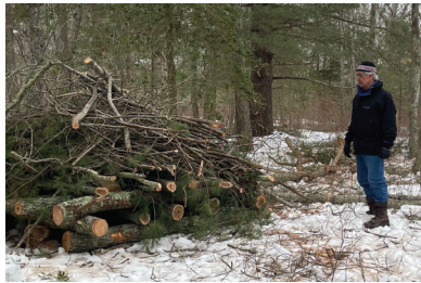
Brush pile for wildlife

In 2019, MLT embarked on a visionary path to develop forest management plans (FMP) for our larger properties. One such property was the Brandt Island Cove District (BICD), located in the West Hill neighborhood west of Mattapoissett Neck Road. BICD includes much of the salt marsh