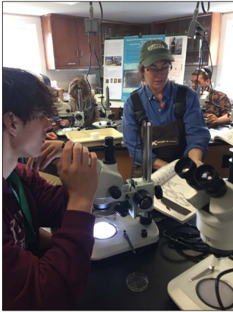
ORRHS marine biology students observe microscopic organisms collected at the UMASS FIELD STATION on Nantucket last spring.