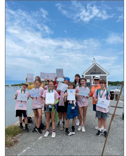
Old Hammondtown 6th grade students sketch views from the dock while attending the STEAM ACADEMY on Cuttyhunk Island

Old Hammondtown 6th grade students learn about Wampanoag heritage during their attendance at the STEAM ACADEMY on Cuttyhunk Island.