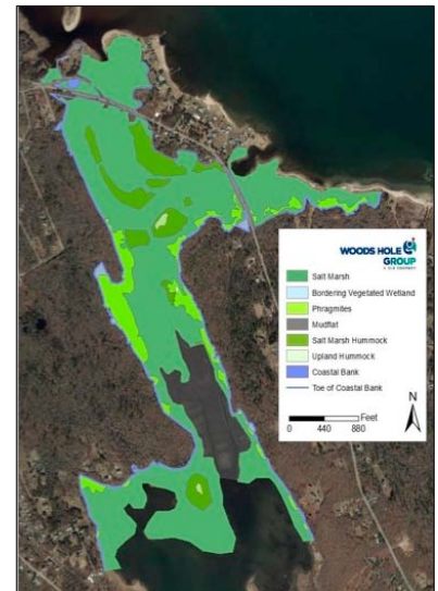
Present day salt marsh resources

For more information about the study, please contact MLT. Also watch for a public briefing at the Mattapoissett Fire Department training room in June that will describe the methods and results in detail. Date and time of the public briefing will be posted on MLT's website and social media, and in the local press. We hope to see you there.