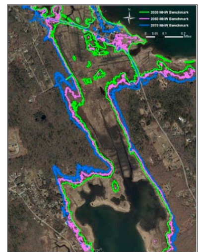
Projected future high tide lines