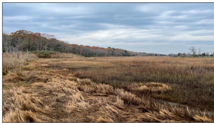
Mattapoissett Neck salt marshes, west side looking north from Brandt Island Cove

degraded marshes around Buzzards Bay according to the Buzzards Bay Coalition (BBC). MLT is working with the Town of Mattapoissett, Plymouth County Mosquito Control Project and BBC. Technical research is underway by two consulting firms: Woods Hole Group and Greenman Pederson, Inc., working as subcontractors to MLT.