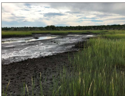
Vegetation damage from crabs along creek bank

degraded marshes around Buzzards Bay according to the Buzzards Bay Coalition (BBC). MLT is working with the Town of Mattapoissett, Plymouth County Mosquito Control Project and BBC. Technical research is underway by two consulting firms: Woods Hole Group and Greenman Pederson, Inc., working as subcontractors to MLT.