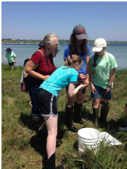
6 th graders on Cuttyhunk for STEM learning about wetlands, birds, waves, shipwrecks, and more!

Our mission is to enhance students' environmental awareness through hands-on learning experiences in our community.