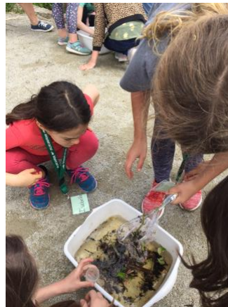
3 rd graders at the Buzzard's Bay Coalition Saw Mill exploring the river and fields for fish, birds, animals, and frogs