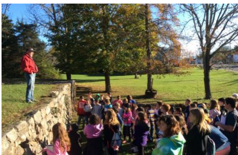
5 th graders on a walking field trip to the historic Tub Mill in Mattapoissett