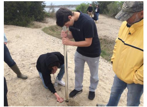
ORRHHS Marine Biology Class conducting the Eel Pond Estuary Water Quality Analysis Program