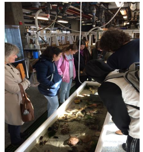
ORRHS at the Marine Biological Laboratory and Woods Hole Oceanographic Institute