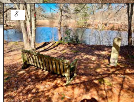
1- Memorial bench at Munn Preserve