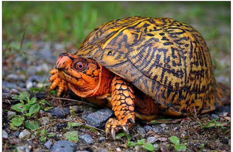
Eastern Box Turtle

When you visit an MLT property please respect the animals and plants, whether residents or visitors, that you find there. But enjoy your time visiting them!