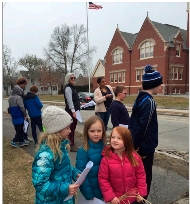
"Map-A-Palooza" during February vacation. Sponsored by MLT Education, Mattapoisett Recreation and Mattapoisett Historical Society