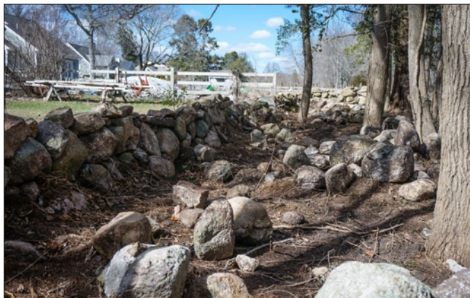
Rebuilding of old stone walls in progress

Many people know MLT's Dunseith Gardens Preserve as the home of Salty the Seahorse and the Silvery Moon Soiree, our annual autumn campfire with s'mores and storytelling. But Dunseith extends farther through gentle woodlands to a small stream, and is surrounded by beautiful stone walls assembled by our ancestors. Thanks to hard work by many volunteers, we are completing major improvements at Dunseith.